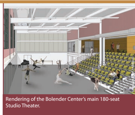
Rendering of the Bolender Center's main 180-seat Studio Theater.